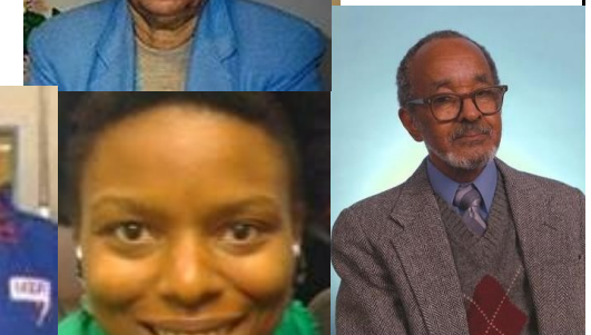
Dr. James West, Awards Banquet Speaker. Co-inventor of the technology for the Cordless microphone and Technical Achiever Award recipient