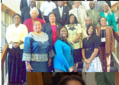
NTA PRESIDENT AND PAST PRESIDENTS