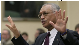
Opening Plenary Speaker