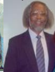
Charles S. Duke Distinguished Lecturer