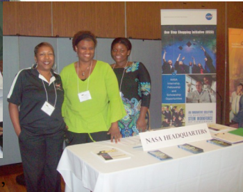
NASA Headquarters Gold Sponsor at Career Fair