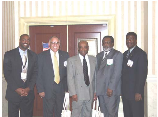
“NASA’s Finest” get-together at the NTA 2002 Conference: