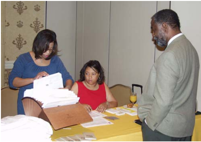
NTA Conference On-Site Registration Desk and Hard Working Crew