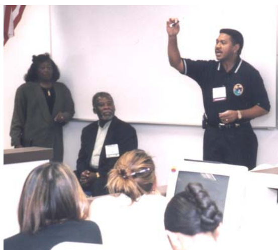
NTA members presenting at Clark High School in Las Vegas, NV